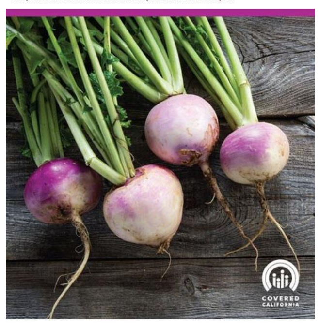
As Seen on Twitter

Do you have a favorite dish where you could use turnips?