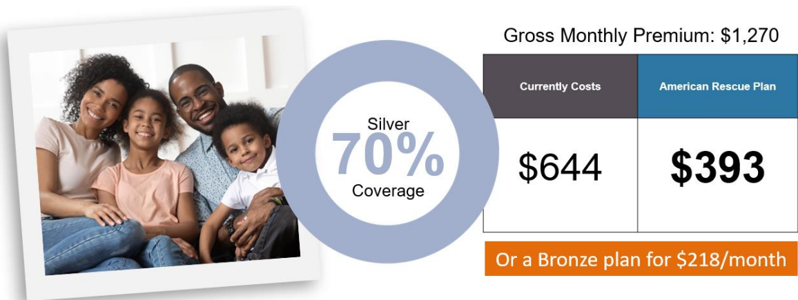
Figure 3: Covered California Enrollees Will See Lower Premiums

The Robinsons in Escondido | Ages: 45, 45, 12, 10 | Income: $78,600/year