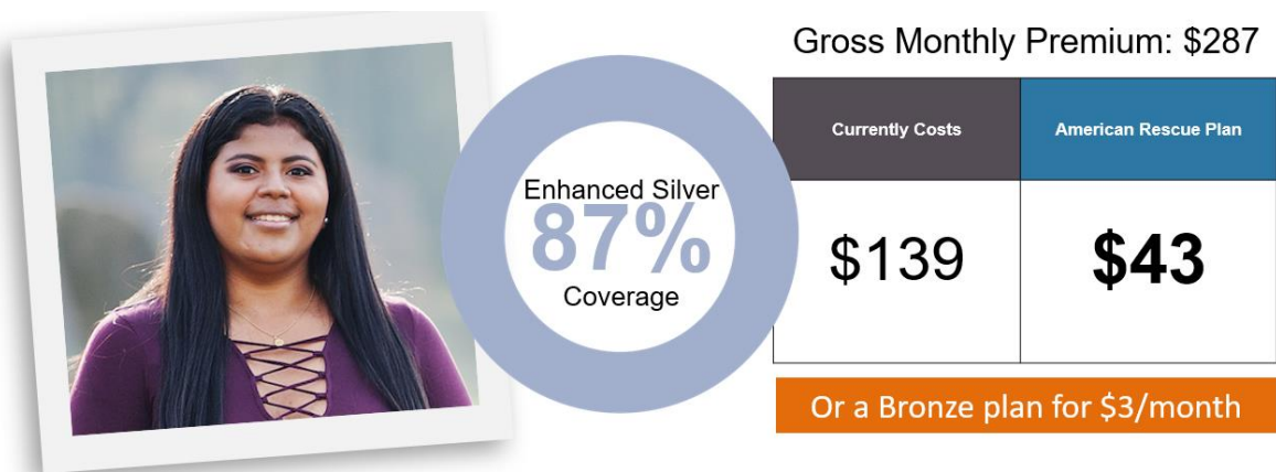
Figure 1: Premiums are Lower than Ever for the Uninsured

Sofia in Chula Vista | Age: 21 | Income: $25,520/year