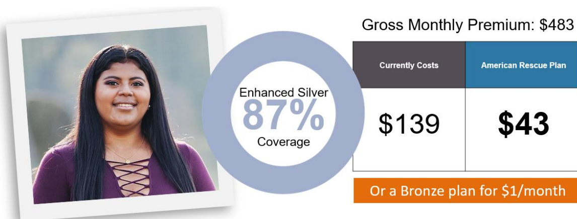
Figure 1: Premiums Are Lower Than Ever for the Uninsured

Sofia in Eureka | Age: 21 | Income: $25,520/year