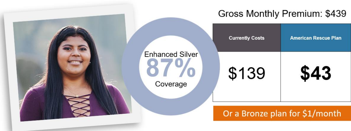
Figure 1: Premiums Are Lower Than Ever for the Uninsured