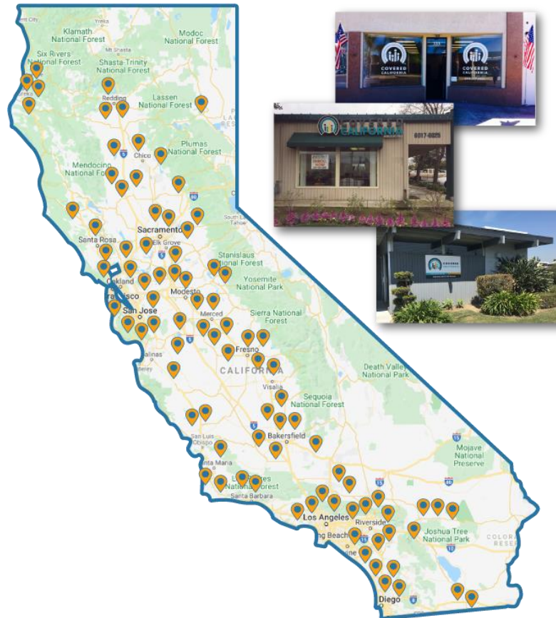
Figure 3: Covered California’s Over 500 Licensed Insurance Agent Storefront Locations Across the State

In addition to signing up consumers through their own through the website, Covered California also partners with certified and licensed enrollers who provide free and confidential help throughout the state. Covered California works with more than 11,000 Licensed Insurance Agents, who have established more than 500 storefronts in communities across California.