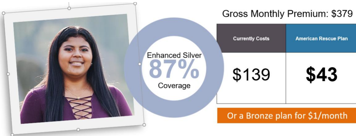
Figure 1: Premiums Are Lower Than Ever for the Uninsured

Sofia in Sacramento | Age: 21 | Income: $25,520/year