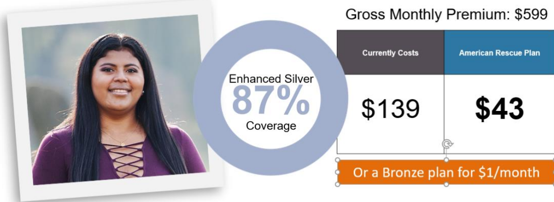
Figure 1: Premiums Are Lower Than Ever for the Uninsured

Sofia in Salinas | Age: 21 | Income: $25,520/year